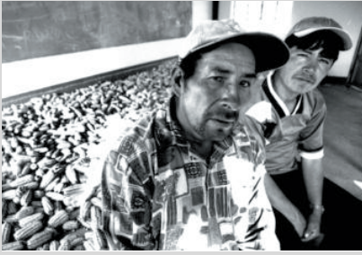
Farmers in Araypalla, Peru, in 2006: "Another area that will be liberalised with the FTA is the distribution of seeds and GM products. The massive arrival of GM maize from the US will prevent Latin American farmers from being able to protect their crops from genetic contamination and will deny people the right to know what they are eating"

didn't buy the corporate seed. The purpose is to enhance profits and overall market control for agribusiness TNCs and their shareholders. The US will not sign an FTA without these provisions. The European Union (EU) pushes most of them as well. European Free Trade Association (EFTA) governments and Japan also use FTAs to get strong IPR over biodiversity in other countries.