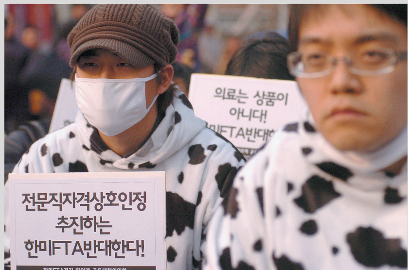
The threat of mad cow disease is an important component of public opposition to the US-Korea FTA. Washington is aggressively using the FTA to reopen to the Korean market to US beef exports.

Meanwhile, consumers' movements, farmers' organisations, and many others are trying to prevent food and agricultural systems from being contaminated by GMOs. Under pressure from Monsanto and others, the US government uses backdoor channels provided by FTA negotiations to force acceptance of GMOs by those countries still resisting them. It has pressured Australia, Ecuador, Thailand, Malaysia and Korea, among others, in this way. Public pressure in Australia prevented any immediate opening of the market to GM products from the US. But the two governments did agree to set up a committee to further the talks. Washington and Seoul allegedly signed a memorandum of understanding through which Korea would not discriminate against US goods in its implementation of the Convention on Biological Diversity's Biosafety Protocol. This means that GM foods from the US should, as much as possible, not be labelled as such when sold in Korea, since that could hurt US food sales.