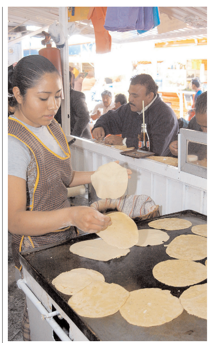
The price of tortillas has been going up dramatically in Mexico not because of a lack of corn but because of the monopolistic structure of the industry that NAFTA has driven.

could not feed corn to livestock, as it was regarded as a staple food for the population, but this ban was lifted in 1996, and the livestock sector became the main destination for imported corn. Grain consumers<sup>21</sup> gained political power needed to influence agricultural and trade policy: they avoided paying the tariffs permitted under NAFTA for corn imports above the quota. The Mexican government effectively practised dumping against its own national corn producers by eliminating the tariffs designed to protect their production. Small farmers were forced to bear a huge burden in order to benefit importers, among them some of the world's largest TNCs.