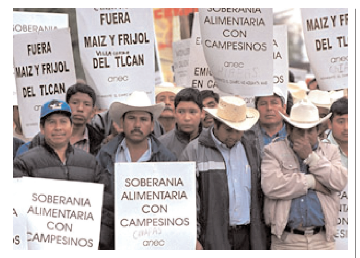
"Maize and beans out of NAFTA – food sovereignty for peassants"